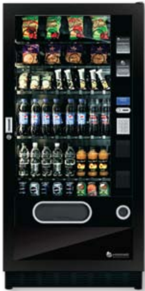
Duo M A+