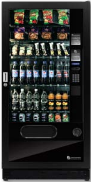
Quattro Max A+