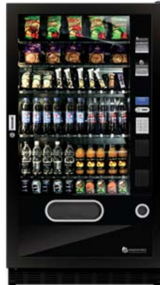
Duo L A+